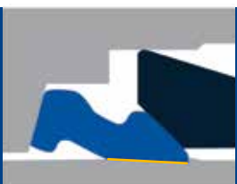
Swagelok® Tube Fitting

The hinging and colletting action of the Swagelok® Tube Fitting directs more material of the back ferrule in close contact with the tube adjacent to the tube grip. The protected stress riser reduces the damaging effects of system vibration.