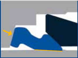
The hinging-colletting design of the Swagelok® tube fitting

The Swagelok® Tube Fitting hinging and colletting action provides more material of the back ferrule onto the tube adjacent to the tube grip. This extra material provides both direct axial support to the tube gripping function and colletting squeeze of the tube, unlike a bowing or bite-type ferrule.