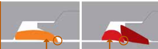
Bite Type systems with one cutting ring | two cutting rings

This action provides a more robust tube grip over a wide range of installations; and safely contains your fluid system without leakage even at maximum working pressure.